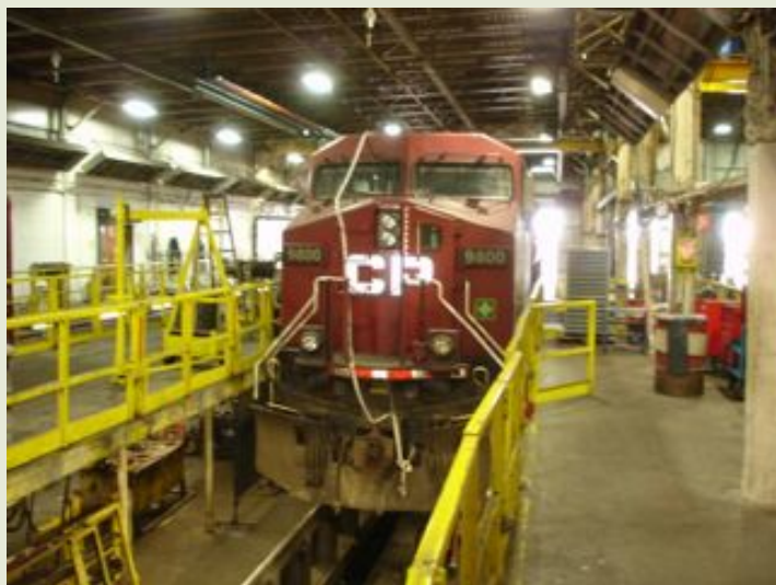
CP 9800 AC4400CW