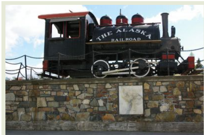
Alaska Railroad 0-4-0