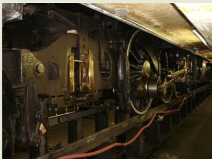
CP 2816 H1b Hudson Running Gear