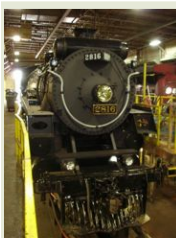
CP 2816 H1b Hudson