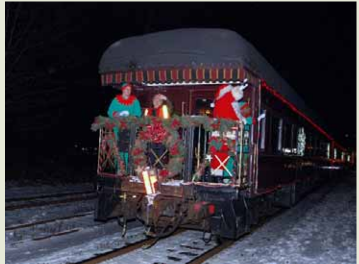
Santa and his helpers wave good-bye as the Holiday Train heads for its final stop in Port Moody, BC.

I invite all model railroaders in the North Fraser area to send me news and updates on their activities. I can be contacted at tajcarr@shaw.ca .