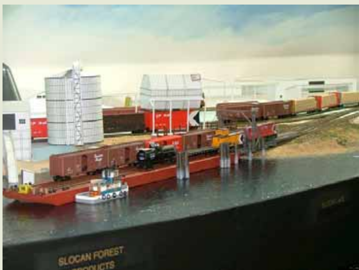
Slocan rail barge being unloaded on the slip at Slocan City with the help of the tug, Iris G