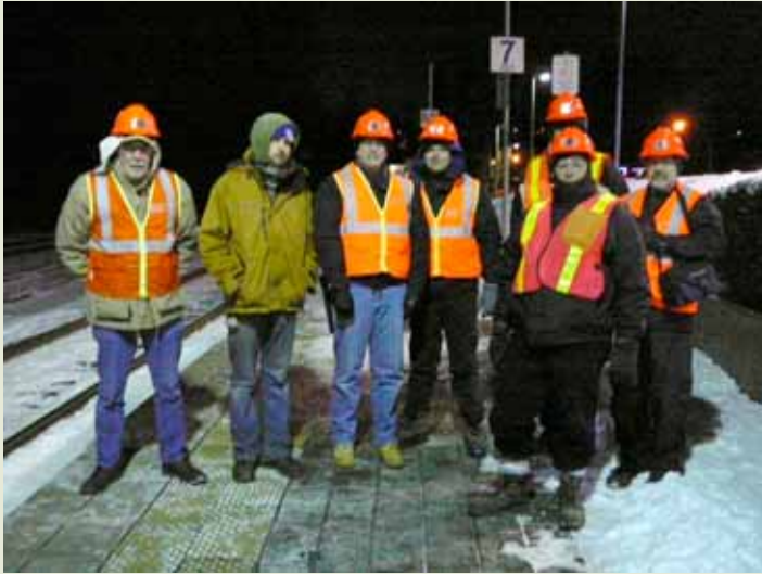
Members and friends of the TraiNgang waiting for the Holiday Train to arrive on Friday, December 19 th, 2008.

The Christmas holiday season is now behind us and as I write this report many parts of our province are either digging out from record snowfalls, fighting rising water levels that threaten to flood their communities, or both.