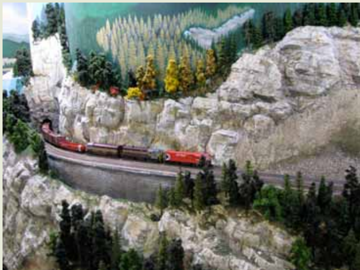
Train approaching Shield's siding which is on cliff above Arrow Lake west of Castlegar