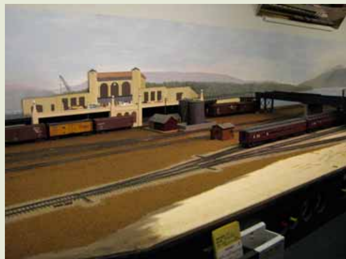
Canadian Pacific Pier BC with Stanley Park and the North Shore mountains in the background.