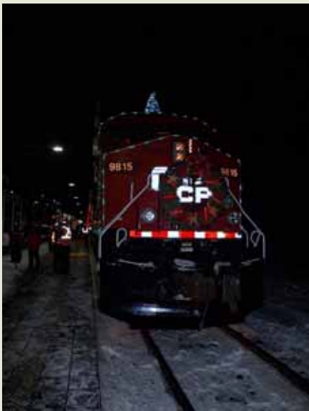
The CPR Holiday Train at the Port Haney Westcoast Express station on Friday, December 19 th, 2008.

The Dewdney Alouette Railway Society (DARS) held their Christmas party at the Maple Ridge Museum on Friday, December 19 th , after the Holiday train left; while members of the TraiNgang went over to a members' home for some light snacks, liquid refreshment and the chance to warm up.