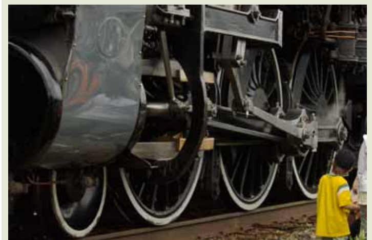
Fascinated with lots of moving parts