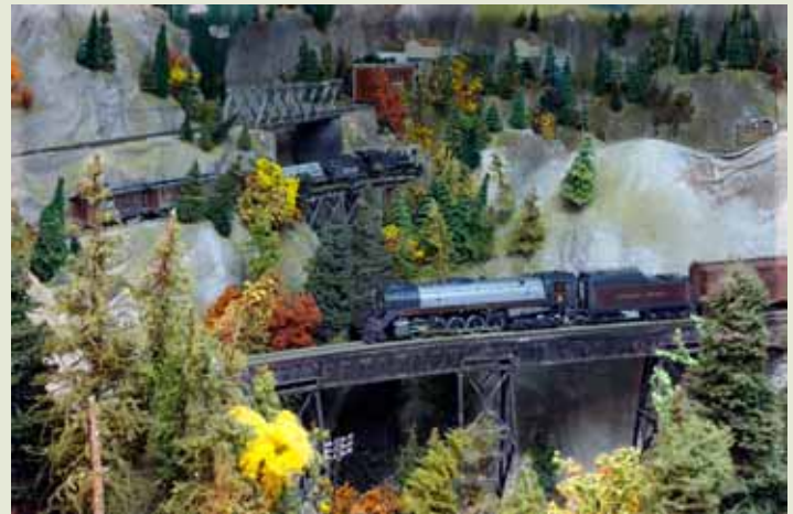
CPR Mainline & EBDC Narrow Gauge

The Eagle Bay Subdivision of the Canadian Pacific Railway is a make believe line which runs along the shoreline of the Shuswap Lake from Revelstoke to Kamloops in the 1950's (Transition period). It climbs at 2.25% grade up to Notch Hill and then turns inland to run to Kamloops. Due to the grade and revenue sources, heavy motive power is required. In addition the Eagle Bay-Deer Creek narrow gauge Hon3 mainline joins up with the main CPR line at Notch Hill. The main revenues of the EBDC are mining (colonium) for export to the Orient, logging for the mill at Deer Creek and farming (livestock).