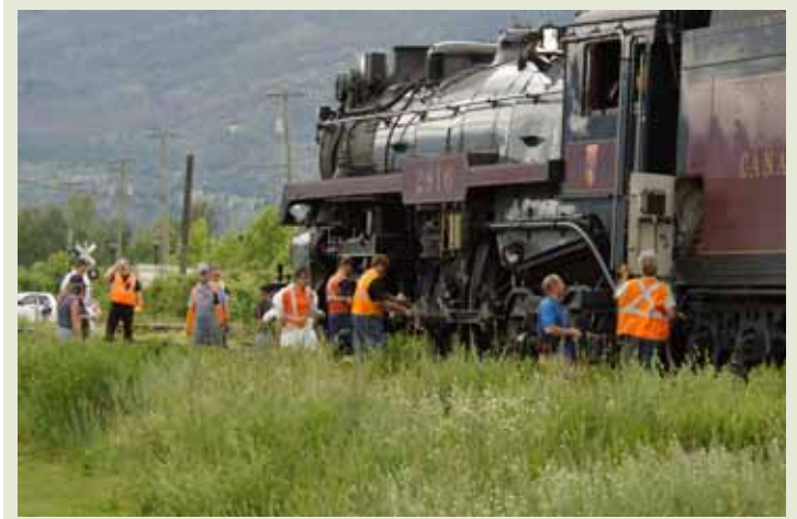
Lots of Fans & Officials

The Spirit Train with CPR 2816 at the head arrived in Salmon Arm on Thursday, June 19th for a visit. The railroad club provided security to help keep people safe and I got to wander around with my kids and enjoy the locomotive. A noticed a couple of interesting things for modellers. For all of you agonizing over the perfect shade of CPR Tuscan to paint on your latest creation I think you can rest easy. None of the coaches seemed to be painted quite the same colour. I noted at least four variations of shading of the Tuscan; some tending toward brown and others red so I know I won't worry too much anymore, I'll just go with one I like.