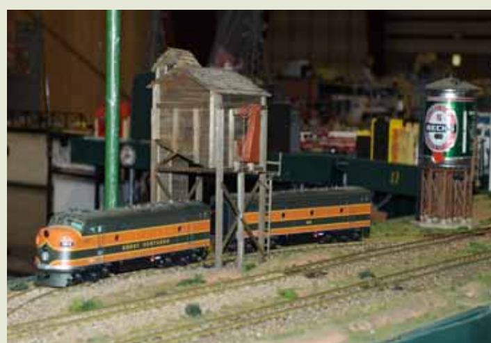
Puget Sound Garden Railway F-Units