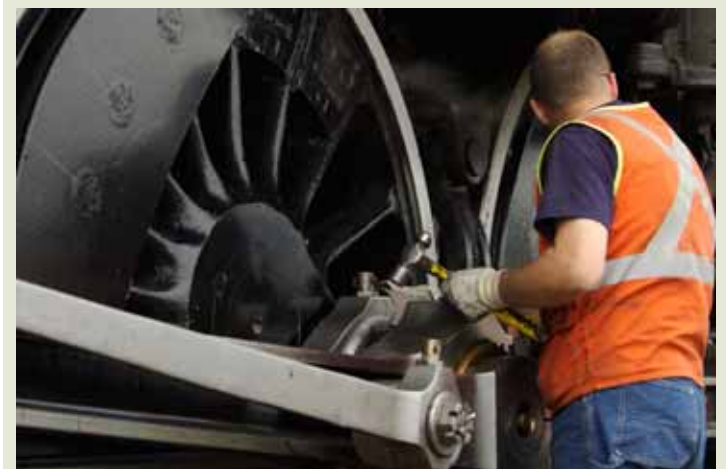
Sophisticated Adjustment Tool