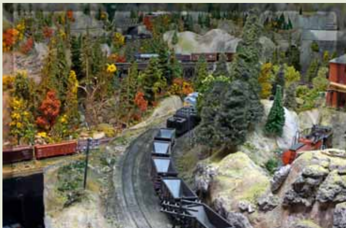
Ore train moving upgrade

Construction began in early June of 2002