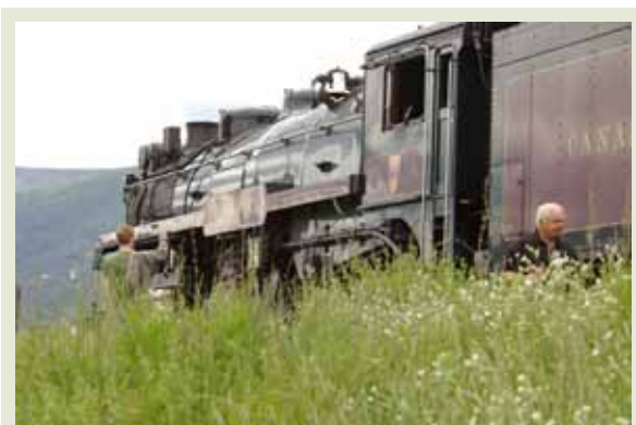
2816 on the main in Salmon Arm