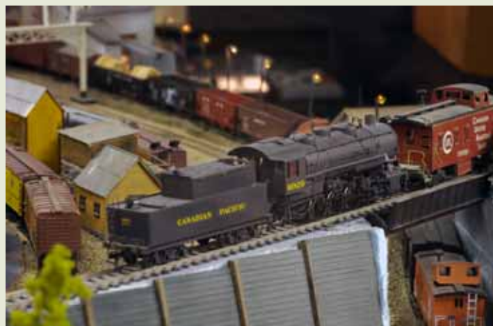
Switching the coal dock

It is hoped that the world demand for colonium will come about soon so that groseline will replace gasoline.