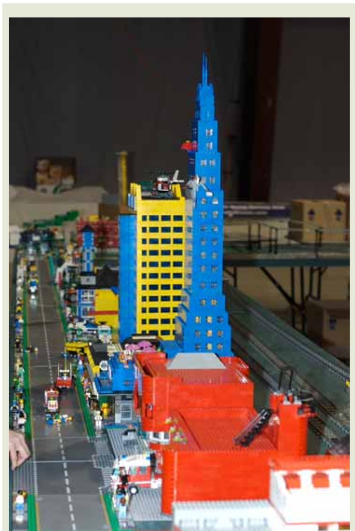
Lots of colour in Lego layout at Chilliwack

A full list of tapes is published in the March and September issues of the BULLETIN BOARD