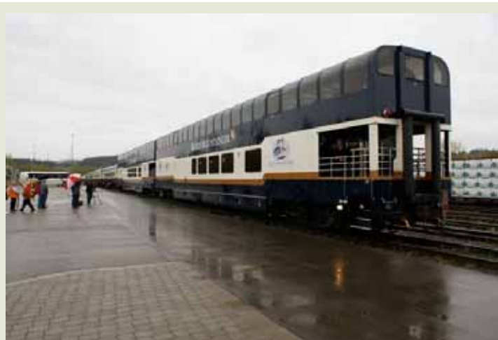
Dome Cars on the Pride of Quesnel