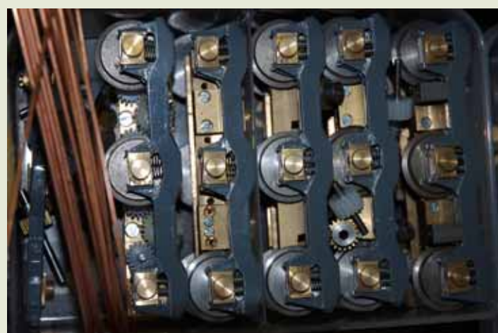
Amazing Scratchbuilt O Gauge Trucks