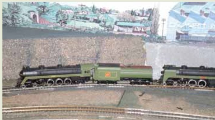
CNR steam power in action at the Maple Ridge Model Railroad Club

I invite all model railroaders in the North Fraser region to send me updates and news on events in their areas. I can be contacted at tajcarr@shaw.ca .