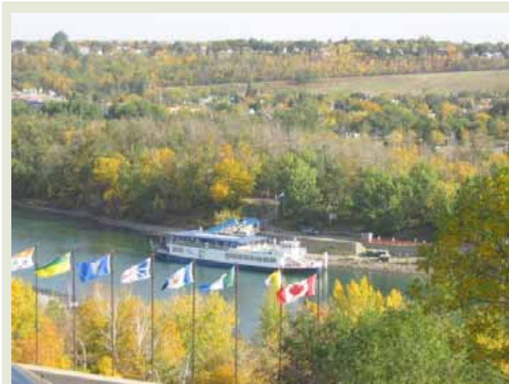
The Edmonton Queen River Boat offers scenic and dinner cruises on the North Saskatchewan River from downtown Edmonton

www.coasthotels.com/hotels/canada/alberta/edmonton/coast_edmonton/overview