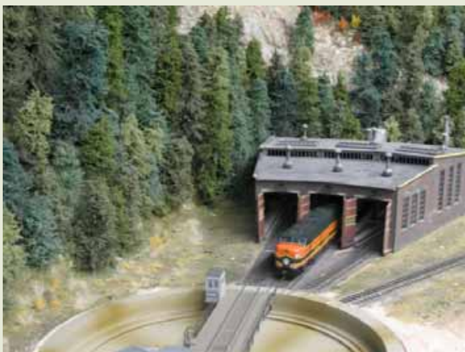
A Great Northern FA waits near the turntable at Monashee Summit on the HO scale layout of the Edmonton Model Railroad Association

For the non-railroaders, while in Edmonton, you won't want to miss the opportunity to visit West Edmonton Mall, the world's largest shopping and entertainment centre. If over 600 shops and services aren't enough to keep you busy, you can always try the wave pool, ice skating rink, casino, or Mind-Bender roller coaster. If something a little tamer is more your style, you can go for a river cruise on the Edmonton Queen Riverboat, check out the exotic plants at the Muttart Conservatory, or visit the Telus World of Science.