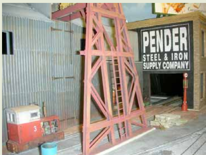
Micro Layout Pender Steel & Iron Supply

In closing, we are looking forward to seeing as many of you that can possibly come and participate in next year's 25 th anniversary TRAINS 2007 show.