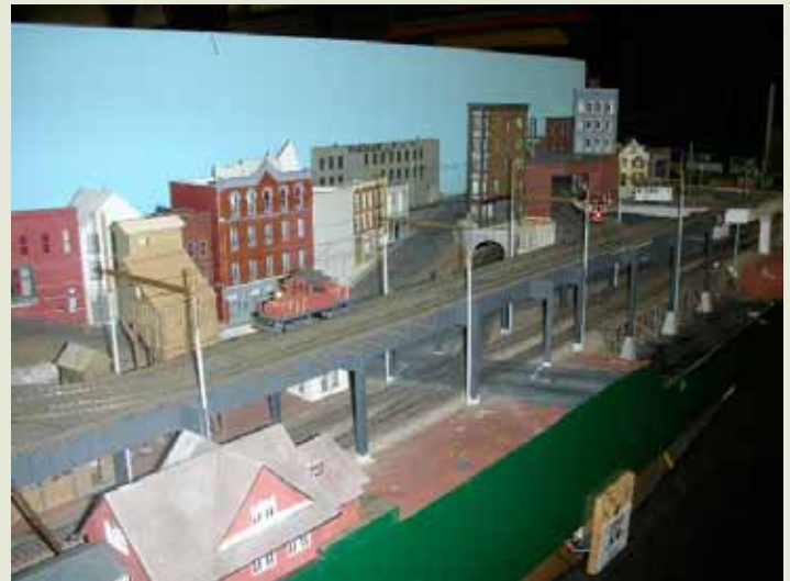
MMRS Elevated Street Cars