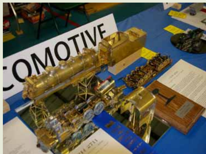
Kyle Gardiner - Locomotive CP #2711 - 0 Scale Brass