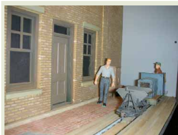
Micro Layout Switch Crew

On behalf of myself, the Trains Committee and participants of the prototype tour a huge thank-you goes to all those involved in the WCRA that made this experience possible."