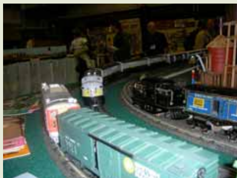
TTOS Curve Meet