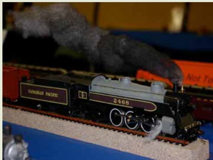
Roy Zschiedrich- Train Steam Freight with Smoke