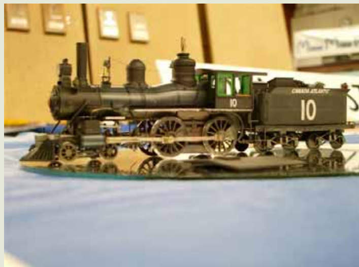
Rene Gourley's model is a beautifully built HO scale Proto 87 model of Canada Atlantic 4-4-0, built from brass, and styrene. He cast many of the parts himself, including the domes. Notice the finely rendered "Russia Iron" boiler jacket and scratchbuilt tender trucks. Rene spent 4 years researching and building this engine. He received 118 out of a possible 125 points in Merit Judging for this engine.