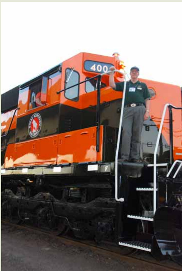
The Author on "Hustle Muscle" at Duluth MN

Apart from some air conditioning problems in our car, which the Amtrak crew was never quite able to fix, the trip home was relaxing and uneventful, although somewhat warmer than anticipated. We spent a day in Seattle with friends, picked up our vehicle and headed for home the following afternoon. Next year's GNRHS convention is at Glacier National Park, Montana, for the 100 th Anniversary of the park. Francina and I are really looking forward to that trip.