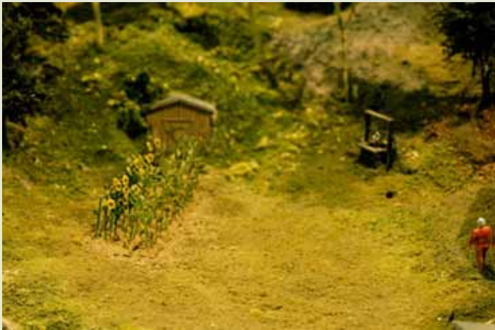
Vegetable Garden with Sunflowers & Corn

The Salmon Arm Model Railroad club is usually on hiatus in the summer with no regularly scheduled meetings in July and August but this year we are a hive of activity. In preparation for display at Northern Lights in Edmonton several dedicated club members have undertaken a number of renovations and upgrades. One of the most involved projects is the removal of the operating lift bridge for a complete overhaul by Neil Sutcliffe. On that same module we have also removed all of the water as it cracked severely in -40C temperatures in Calgary several years ago and no effective and unobtrusive repair could be found. Redoing all the EnviroTex has been a time consuming experience. In addition all of the electronics and wiring are being upgraded on this and several other modules to ensure continued worry free operation. Refreshing of scenery is occurring around the layout although this seems an almost continuous job. Many of these changes will not be readily apparent to casual observers but it will serve to keep the layout fully operational as it passes into its third decade having