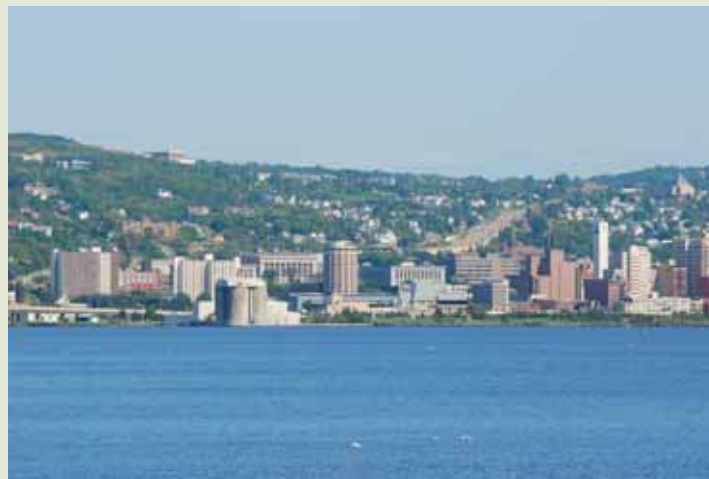
Duluth Skyline from the Harbour On Lake Superior

7th Division http://pnr-nmra.org/7div PNR http://pnr-nmra.org NMRA http://www.nmra.org NMRA Canada http://www.nmracanada.ca