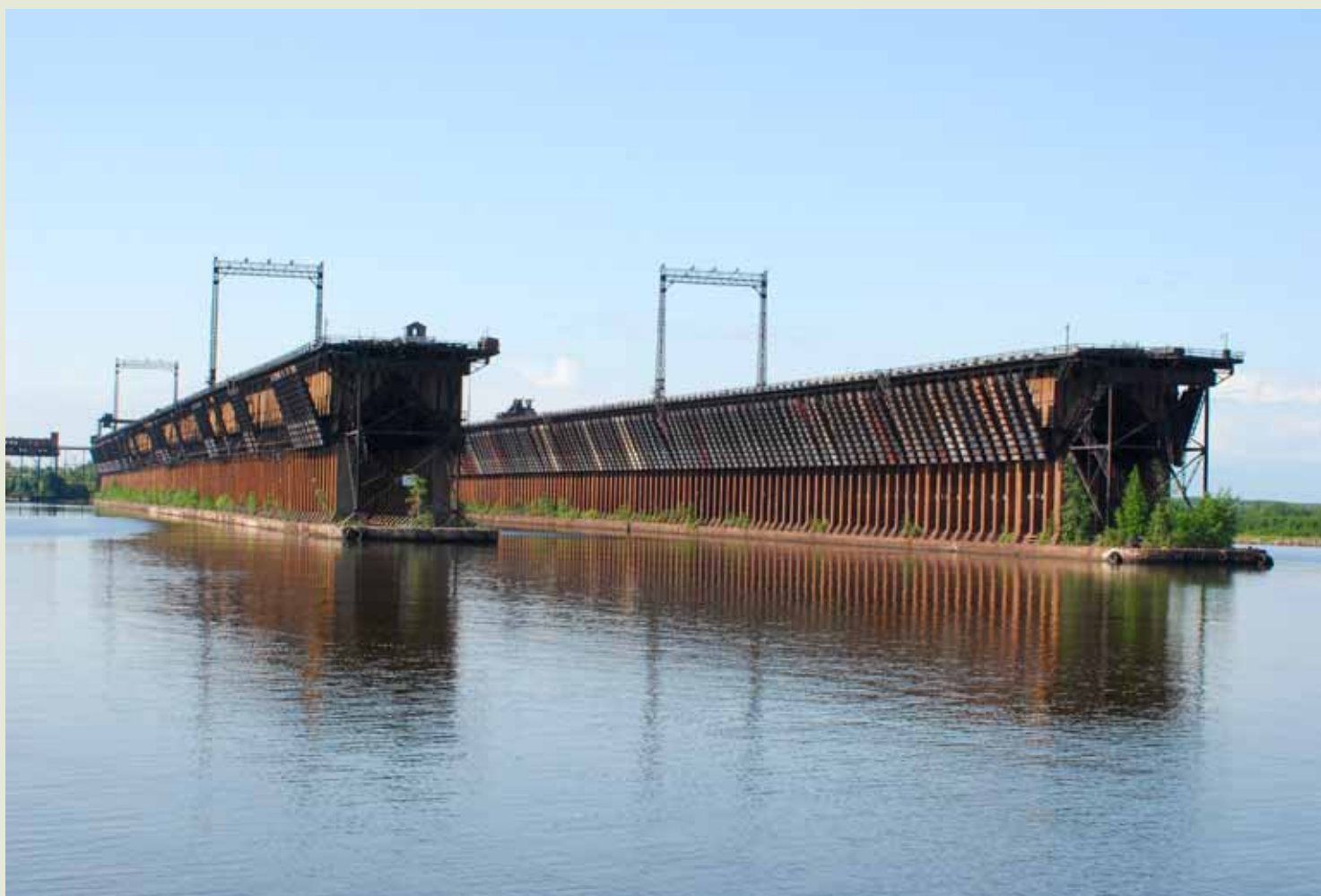
Former Great Northern Ore Loading Docks In Duluth / Superior Harbour

The GNRHS convention itself was very well organized and gave us the opportunity to visit not only the Duluth area, but also the Iron Range that has supplied iron ore to the US steel industry for so many years. We explored former operations of the Great Northern and the Duluth, Missabe & Iron Range railroads, visited old and still operating iron ore mines, toured the ore loading docks in the Duluth/Superior harbour, and took part in the usual convention activities. A particular highlight for myself was the op-