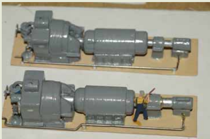
Scratchbuilt Steam Turbines for Power House

Whew – hot, very hot summer. It has been so hot that most people in BC have been staying indoors. Of course the fires in BC have been incredible with many evacuations. I don't think and surely hope none of you have been affected. Needless to say my outdoor activities have been some what curtailed but the SAMRA group has been busy rewiring the layout (5 out of 13 modules have been done) and guess who does most of that. The lift bridge is been completely rebuilt and we are just waiting for the harbour scene to be completed (completely stripped down to the plywood, new fibreglass matt applied and as of today Aug 7 three coats of Envirotex poured) so that it can now be wired. We are slowly changing over all lights to LED's and new Ngeineering simulators and special effects. We are hoping to have all this done in time for Edmonton.