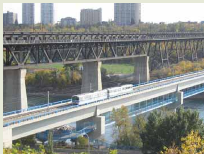
A two car LRT train crosses the North Saskatchewan River beside the 96 year old High Level Bridge. A streetcar runs on the top of the big bridge on weekends, connecting downtown Edmonton to the Strathcona Market shopping area.

It is the Convention Committee's goal to offer you more activities than you can fit into your schedule. But whatever you choose to do, please make sure you leave some time to renew acquaintances and make some new friends. After all, isn't that what it's all about?