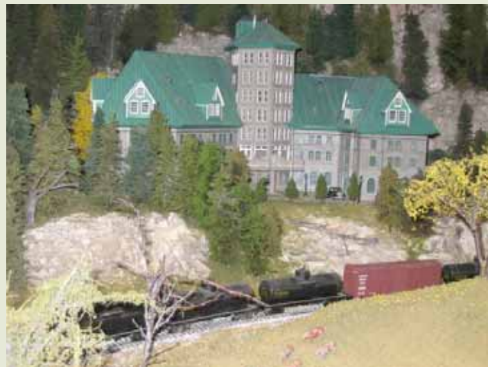
The Crickinback Inn is one of the scenic features of the HO scale Monashee Pacific Railway. You can sign up to participate in an operating session on the MPR, or learn how members have made over 12,000 trees at Mike Nobl's scenery clinics

Among my favourite activities at any model railroad convention are the prototype tours. These give the average modeler a chance to get into places they might never otherwise see, such as big industries or railroad maintenance shops. If these appeal to you too, then you won't want to miss the bus to Lehigh Inland Cement on Thursday morning. This guided tour will show you how they make cement at the plant in northwest Edmonton. This is a very rail oriented operation, with the raw limestone arriving on unit trains from the Cadomin quarry over 340 kilometres away, and product leaving every day in covered hoppers.