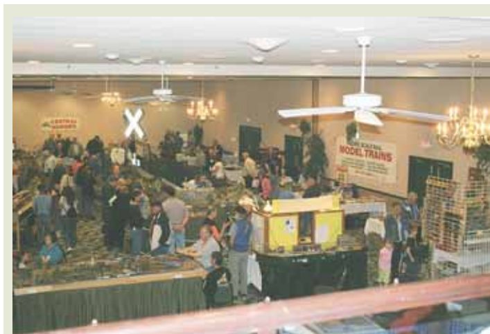
The Show Floor