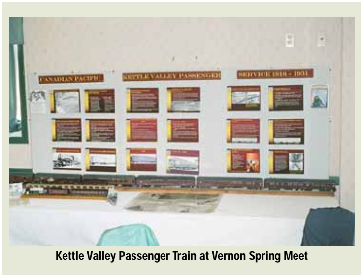
Kettle Valley Passenger Train at Vernon Spring Meet