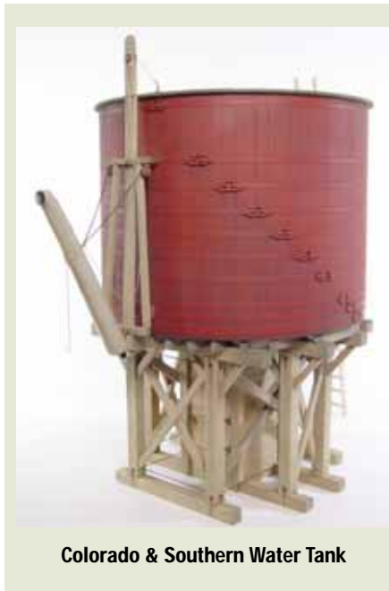
Colorado & Southern Water Tank

The sand house is a O scale model based on the D&RGW Durango facility with a shortened house and a shortened and widened 'Chama' sand bin and sand delivery hose. The sand house is scratchbuilt built from styrene and the bin and tower from home cut lumber. The sand reservoir was turned from hardwood dowel, with lids, piping and bits scratchbuilt from styrene and brass wire. The only commercial parts are 2 hinges, a lamp reflector and a barrel and broom inside a partially open door. Notice the beautifully done weathering on the sandhouse, where dust and dirt accentuate the textures of the board and batten siding. The model shows how a prototype structure can be modified to meet the needs of your own layout, while still retaining that prototype's style to make an outstanding model.