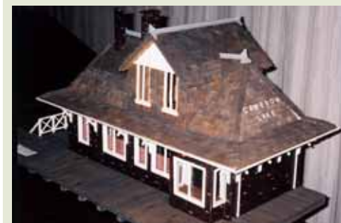
Cameron Lake Station