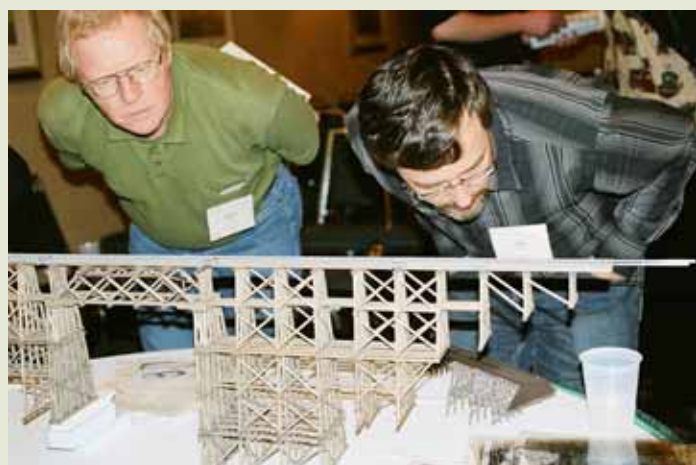
Bridge Clinic Attendees